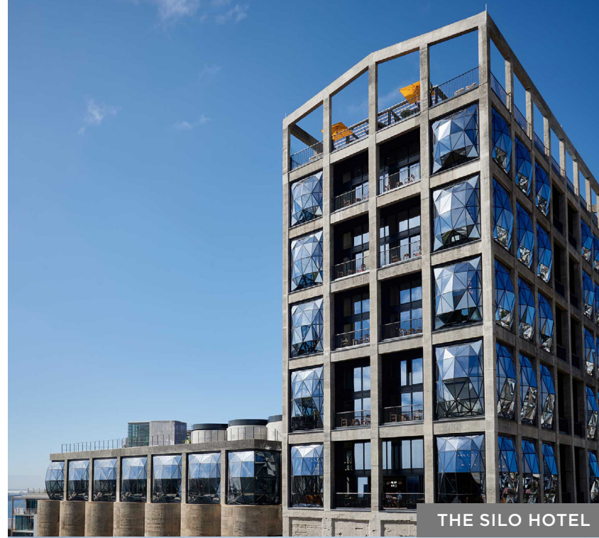
THE SILO HOTEL