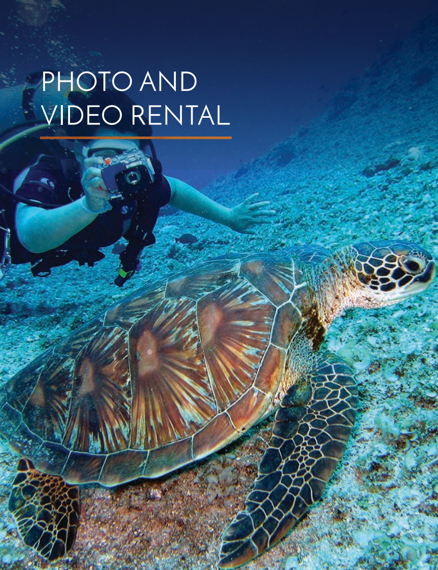
PHOTO AND VIDEO RENTAL

Rent a GoPro to capture the treasured moments underwater. Capture amazing footage and photos of the beautiful marine life in stunning high definition.