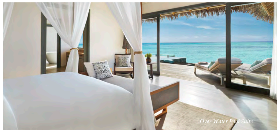
Over Water Pool Suite

The villas offer a wonderful sense of seclusion outdoors and a sociable space within, perfect for families or two couples, with one king and one twin bedroom and an interior interconnecting door.