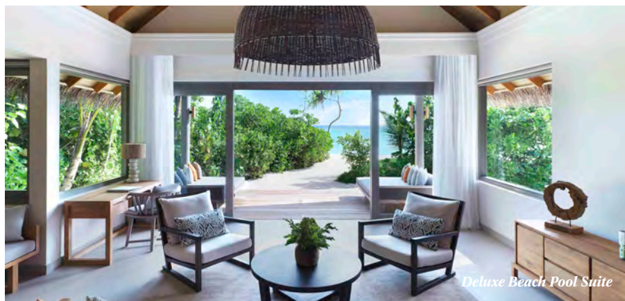
Deluxe Beach Pool Suite