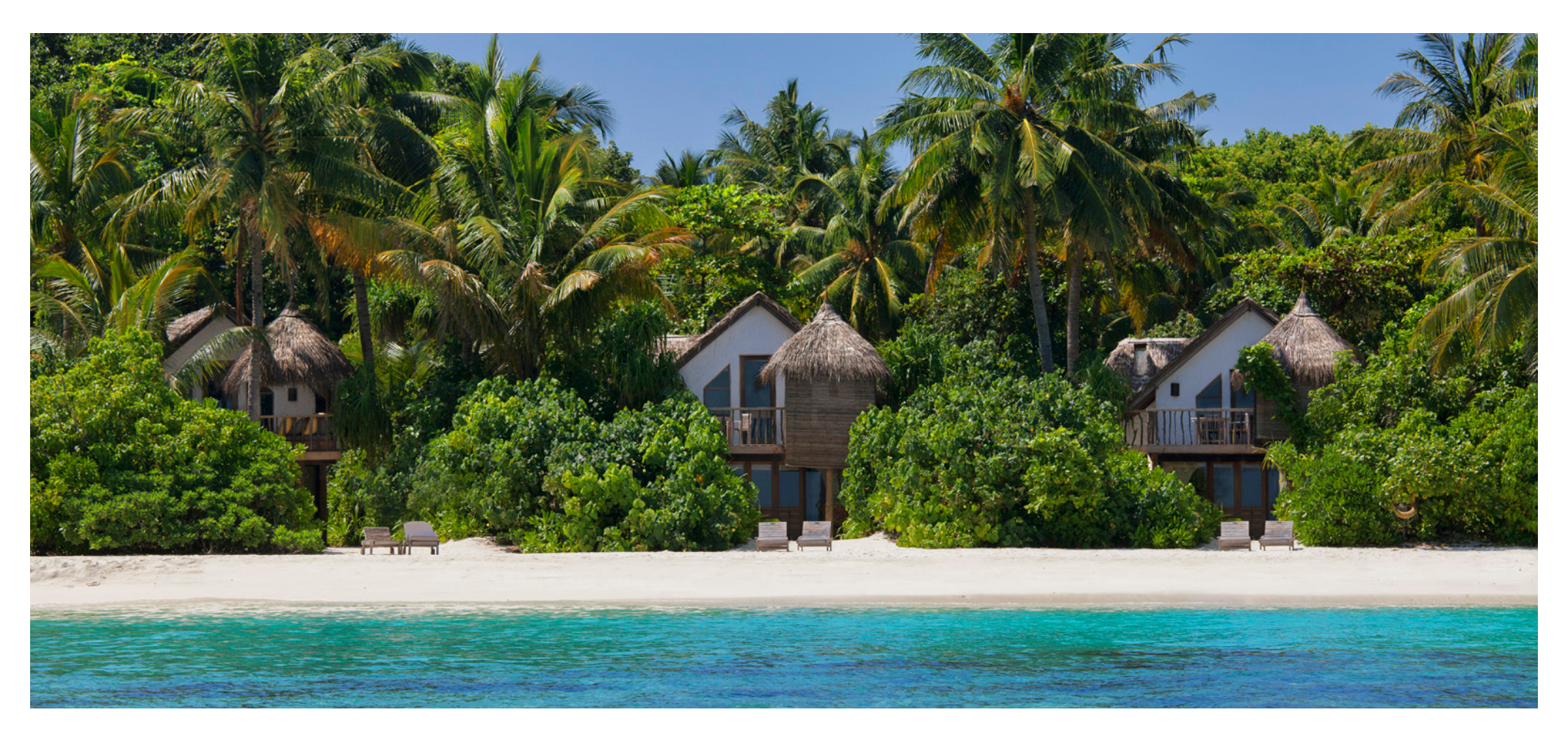
One bedroom Total area 235 sqm. / 2,530 sq.ft. | Max Occupancy – two adults and two children