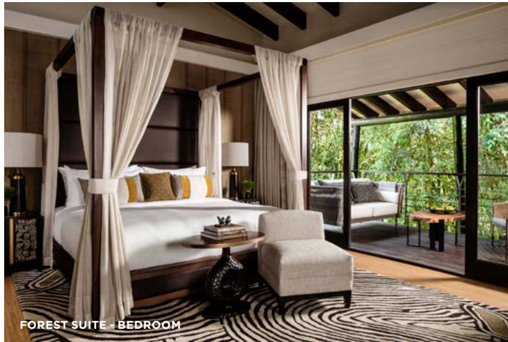
FOREST SUITE - BEDROOM