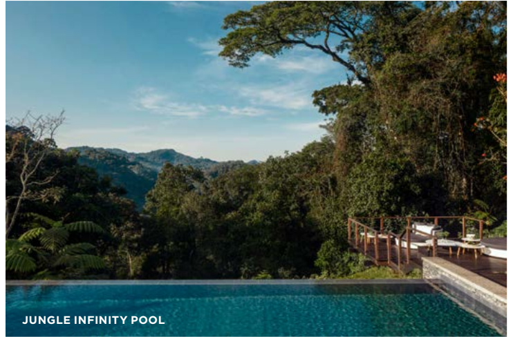
JUNGLE INFINITY POOL