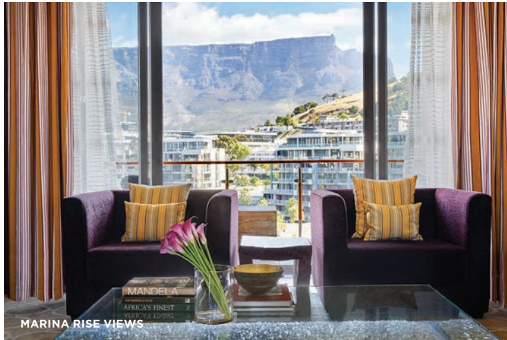
MARINA RISE VIEWS