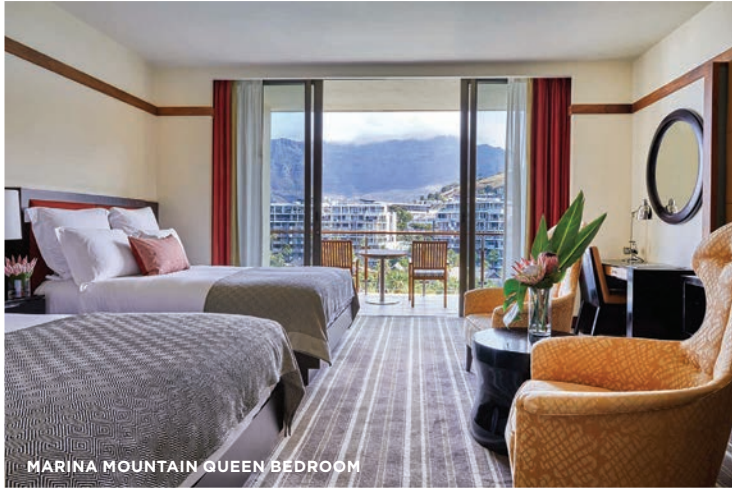
MARINA MOUNTAIN QUEEN BEDROOM