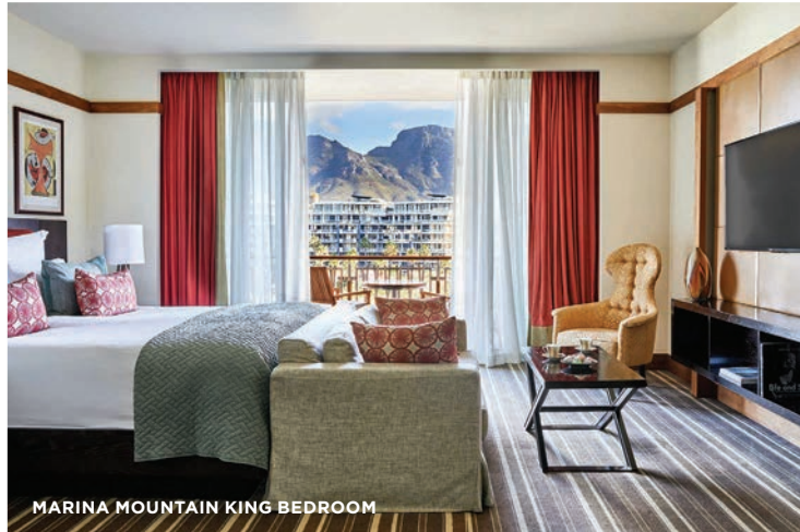
MARINA MOUNTAIN KING BEDROOM