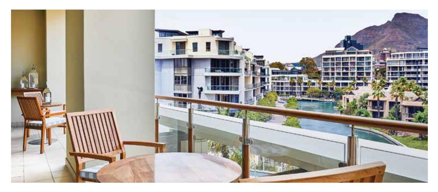
CAPE TOWN South Africa