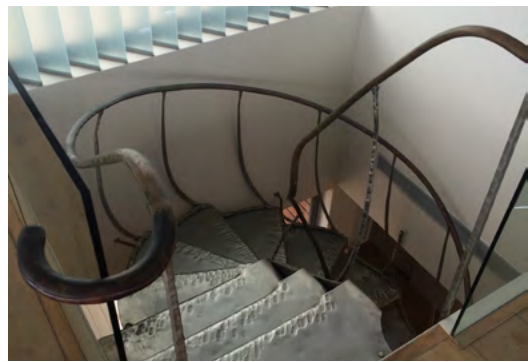
SPIRAL STAIRCASE LEADING TO TOP LEVEL

The spiral staircase and infinity pool could be hazardous to children under the age of 14 years. Please discuss a reservation for children between 10 - 14 years with Ellerman House Reservations.